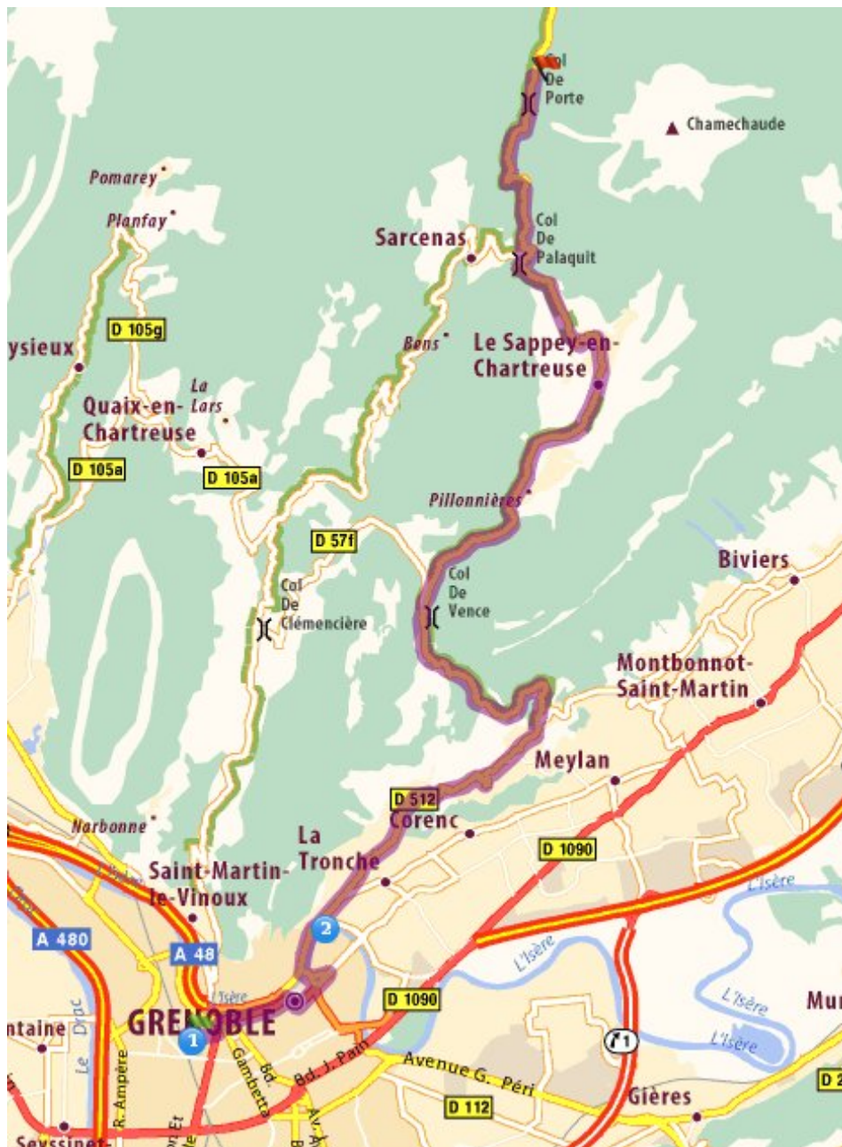
Hôtel Cartusia, col de Porte, Sarcenas 04 76 88 83 18